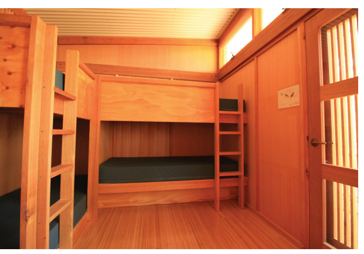
Four-bunk room interior.