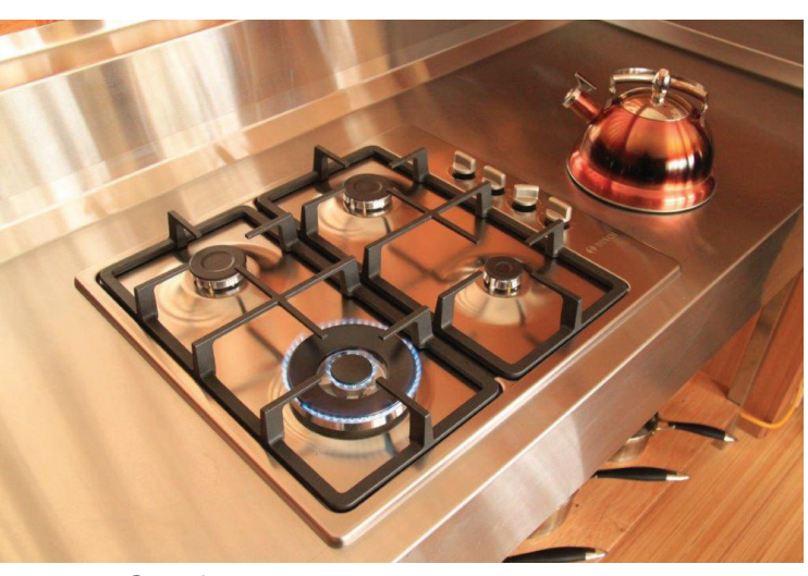
Gas cooktop stove.