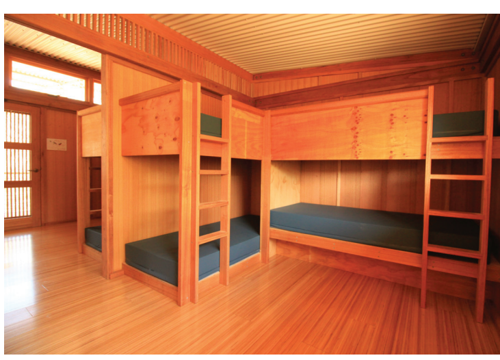
Eight-bunk room interior.