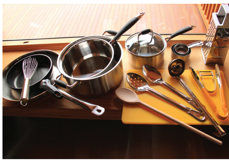
Cooking utensils, biodegradable detergent and scourers are provided. Remember to bring your own tea towel, cutlery, bowl, plate and cup.