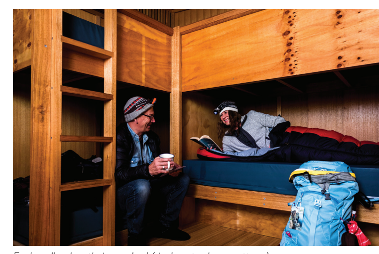
Each walker has their own bed (single extra-long mattress). You need to bring your own sleeping bag (and inflatable pillow, if desired).

Please check all items on the <u>packing list</u> to make sure you have everything you need.