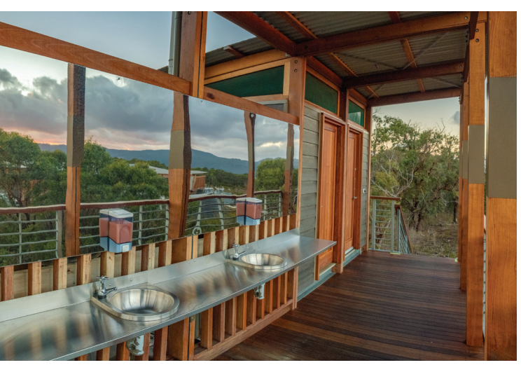
Four toilets at each cabin site, and antibacterial hand soap provided.